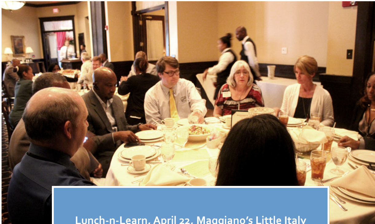
Lunch-n-Learn, April 22, Maggiano's Little Italy

BBQ & Facility Tour North Metro P&DC Mailpiece Design Professional